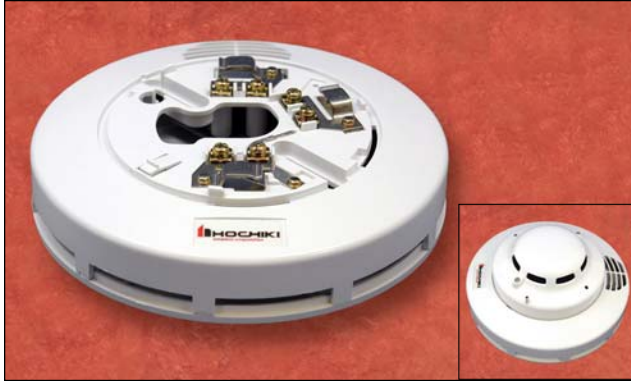
Shown without sensor