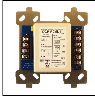
Back side of R2ML-I