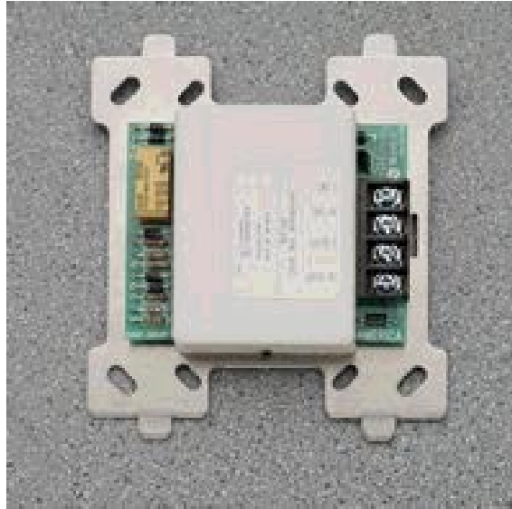
Back side of a DCP-SCI

The contractor shall furnish and install where indicated on the plans, the Hochiki DCP-SCI short circuit isolator. The modules shall be UL listed compatible with Hochiki Digital Communications Protocol (DCP) supporting control panel loops. The isolator module must be suitable for mounting in a standard 4" square electrical box. The isolator module must provide a yellow LED for indication of status.