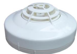
Heat Detector R.O.R & Fixed Temp. Model : DET-C632