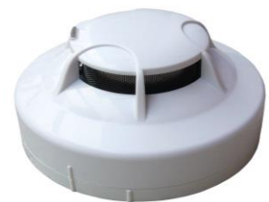
Optical Smoke Detector Model : DET-C631