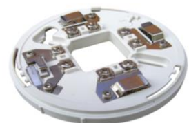
Standard Base Model : DB-6