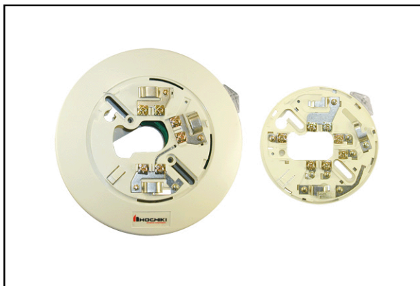
SCI-B6 & SCI-B4