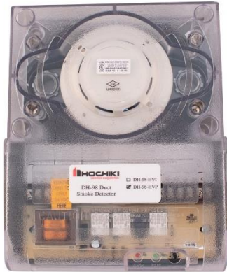
Duct housing is available with either a conventional photoelectric or ionization detector